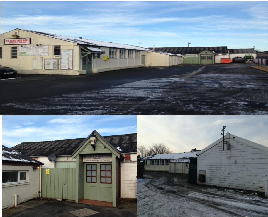
Plans for the new village hall are finally underway. This year should see building work commencing